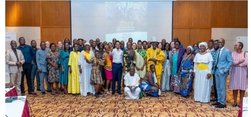
Civil society organisations, including young people