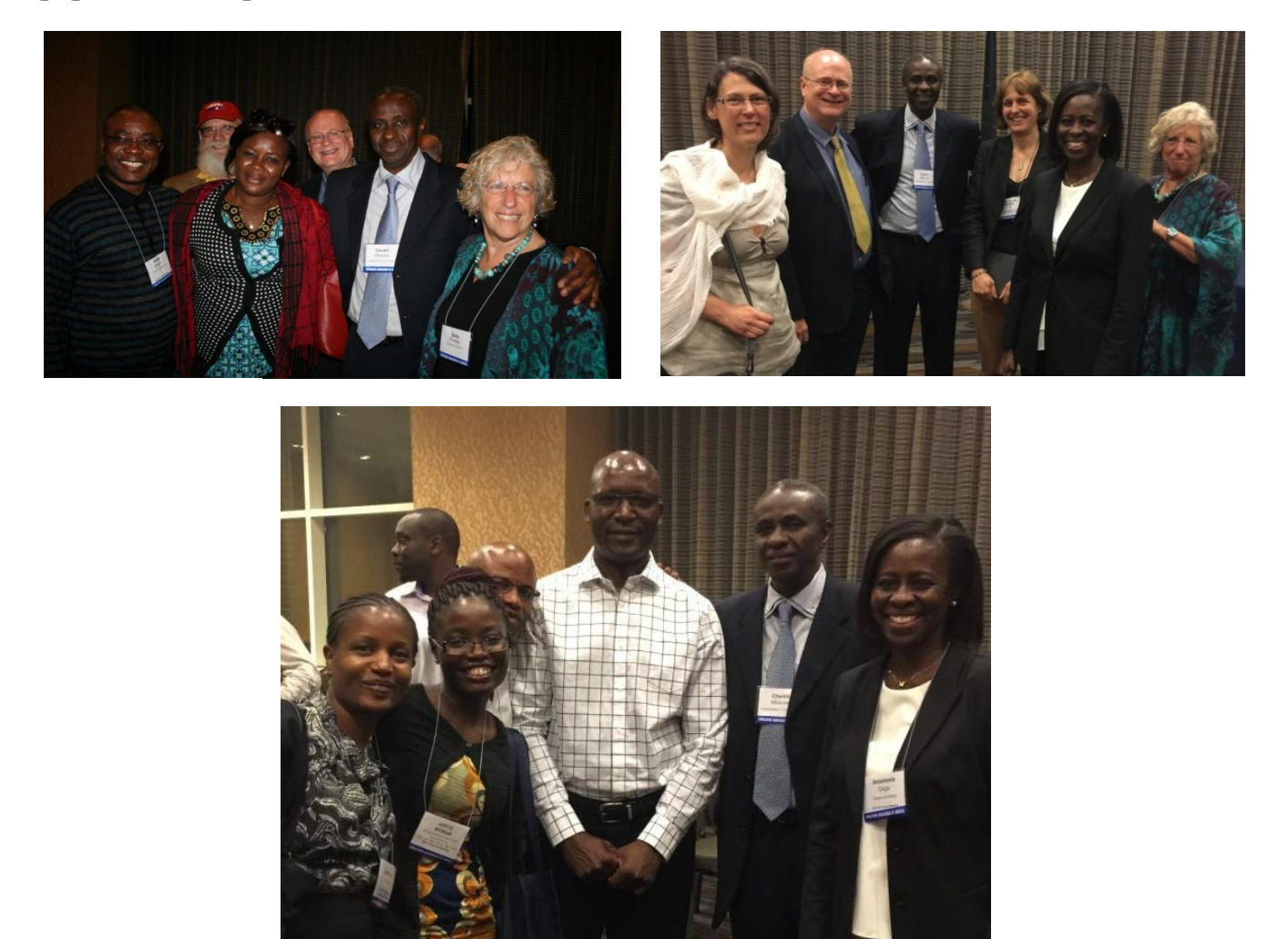
For more information on Cheikh Mbacké's accomplishments and contributions to the population field please read the letter of nomination.

The numerous participants appreciated the warmth of the ceremony that permitted all to give tribute to an outstanding figure in the world of population sciences.