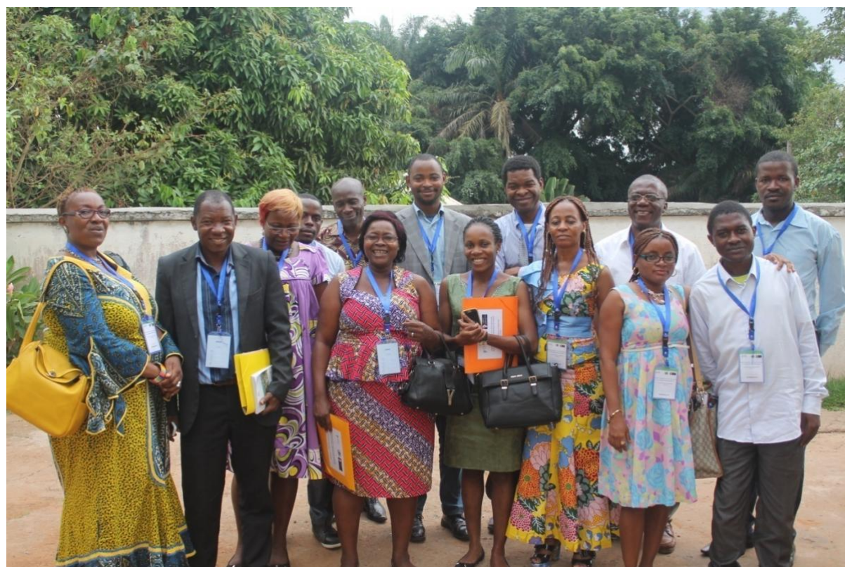
Journalists and researchers.