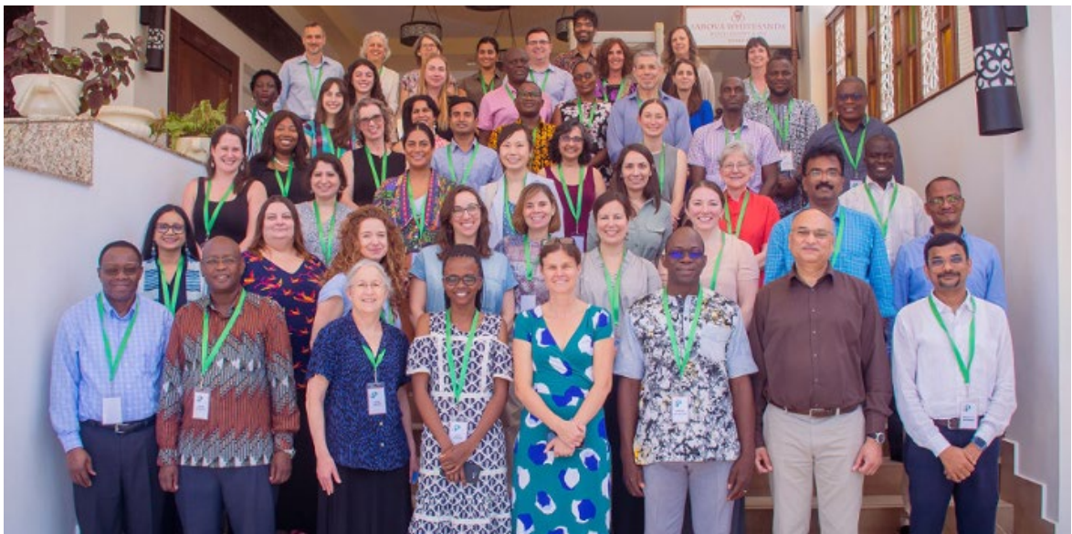
Participants at the IUSSP Meeting in Mombasa

On March 5-7, 2024, IUSSP convened an international expert group meeting in Mombasa, Kenya, on assessing approaches to demand-side family planning measurement with a reproductive rights and justice framework. Over 50 participants attended the three-day workshop, which was supported by the Bill & Melinda Gates Foundation with funds to the IUSSP, and USAID through funds provided to the Data for Impact project. This report is a summary of the discussions. It is presented in the order of the agenda (see Appendix 1 for full agenda). The meeting was organized first around grounding frameworks and then participants examined different methodological approaches to measuring demand side measures, discussed data sources, and engaged with data users. Much of the meeting time was spent on deep discussions that are summarized in the relevant sections.