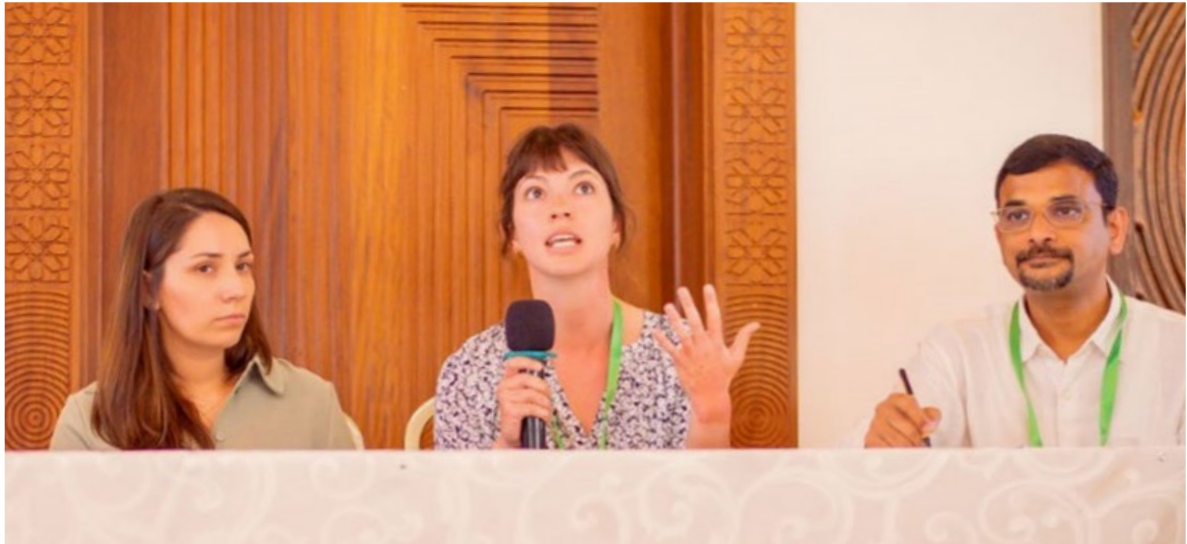
Presentations and discussion during IUSSP Mombasa meeting

Contraceptive preferences are important for reproductive outcomes, such as contraceptive continuation and pregnancy, but current measures are inadequate, assuming that contraceptive users are using a method they want, and not taking into consideration preference changes over time. Measuring contraceptive preferences could improve the assessment of the quality of family planning services and elevate contraceptive autonomy. However, there is limited or no information about changes in contraceptive preferences. The objective of the study was to assess the consistency of contraceptive preferences conditional on consistency of usage and to identify demand- and supply-side factors and life events associated with the consistency of these preferences.