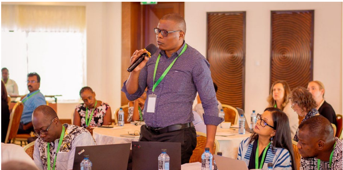
Inputs from a participant at IUSSP Mombasa meeting