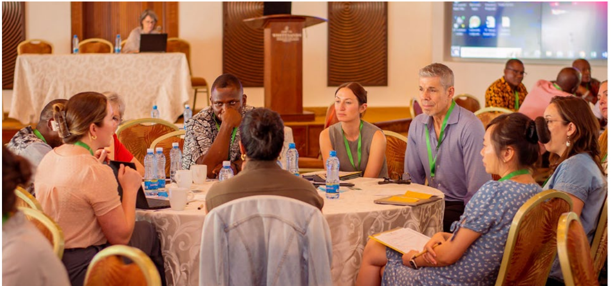
Breakout discussions during IUSSP Mombasa meeting

Preliminary findings from 54 selected studies showed a focus on preference-aligned fertility management; the importance of contraceptive autonomy; contraceptive preference measurement as it relates to autonomy; diverse language used in the field; and proposed measurement changes. The next step is data extraction from the studies.