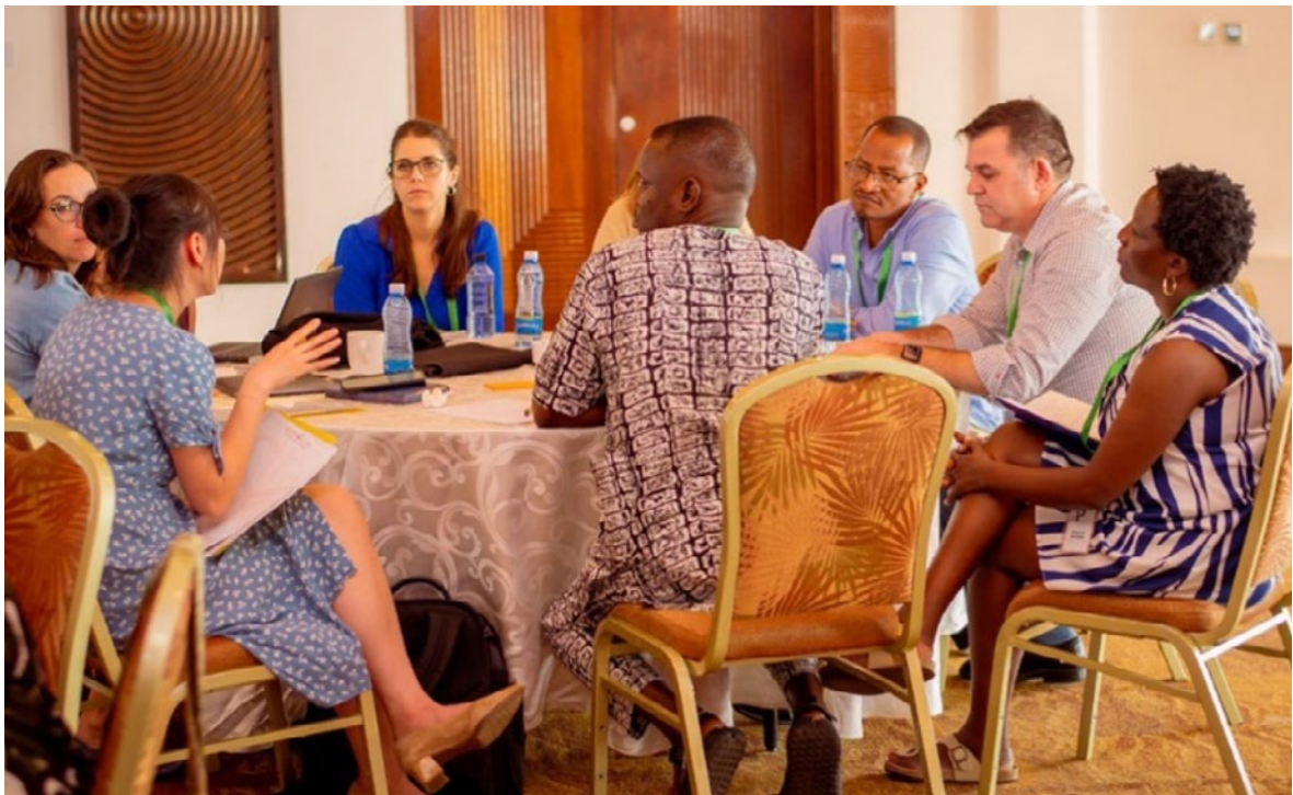
Breakout discussions during IUSSP Mombasa meeting