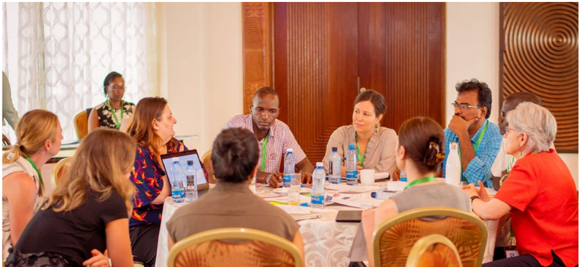
Breakout discussions during IUSSP Mombasa meeting

We need agreement around denominators for global standards and we need measurement approaches that are applicable across countries. We also need to decide whether married and unmarried women will be treated the same way, and whether they will be asked questions about their demand or if that will be inferred from the measure. For questions about current use or desire to use 'right now', there is some benefit to allowing respondents to have a bit of choice in their own interpretation of the question while providing guidance. The measures hold promise, but there is a need to provide consistency and decide which ones are more easily scalable and which ones might be helpful for local resource allocation or for national policy.