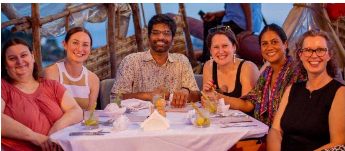
Wednesday night group dinner on the Tamarind Dhow