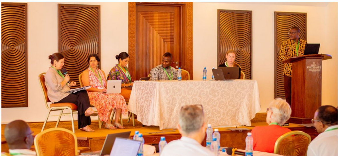
Presentations and discussion during IUSSP Mombasa meeting

The studies showed that contraceptive use is not a measure of demand, autonomy, and well-being, and that balance is needed between what is conceptually ideal and what is empirically feasible. Capturing latent demand by asking “Do you want to use a method?” is seen as an elicited unconstrained demand for contraception at the present time. In addition, identifying an unconstrained demand from the constraints and constraint-induced demand that women face at the time when the question is asked raises serious risks of ex-post rationalization biases, hypothetical framing biases, cognitive anchoring, and reference dependence. It is not valid to assume that one can reasonably answer such questions when faced with these risks. Indeed, we put too much weight on demand questions. Honest responses to biased questions equals biased answers. It is also important to note that agency and autonomy are not the same things; agency is much more complicated. To be person-centered relates more closely to autonomy, while to be preference-centered relates more to agency.