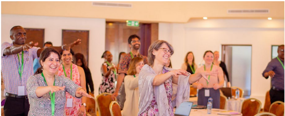
Energizer during IUSSP Mombasa meeting