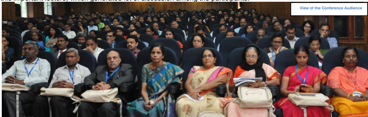
View of the Conference Audience